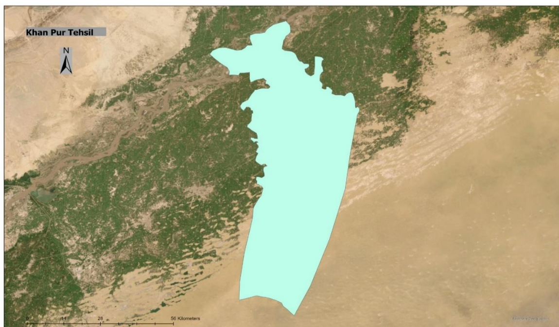
Figure 1: Map of Tehsil Khanpur

Map of Tehsil Khanpur depicting UCs is attached below: