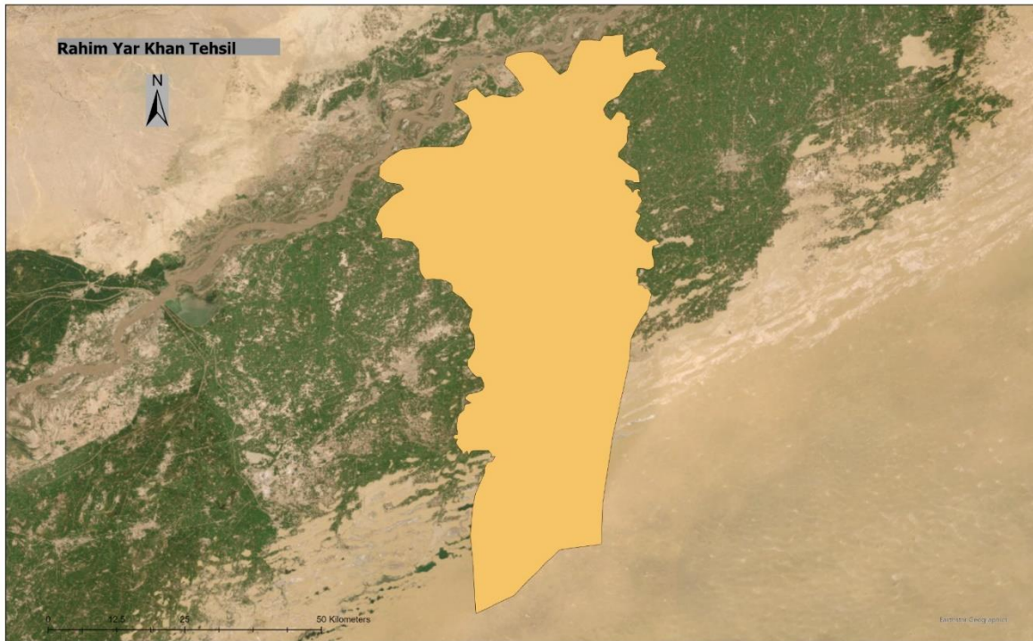
Figure 1: Map of Tehsil Rahim Yar Khan

Map of Tehsil Rahim Yar Khan depicting UCs is attached below: