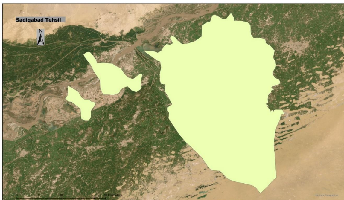
Figure 1: Map of Tehsil Sadiqabad

Map of Tehsil Sadiqabad depicting UCs is attached below: